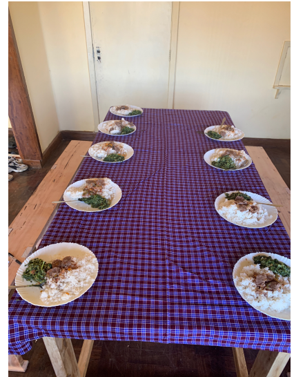
Breakfast – tea and savoury donoughs, Lunch – rice, meat and spinach